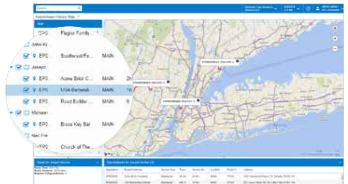
At-a-glance appointment history