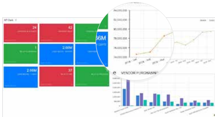
Control project costs and improve profitability

Maximize project profitability, lower risk and easily manage financials. Acumatica Construction Edition allows you to accurately forecast and manage job costs, profits, cash and taxes.